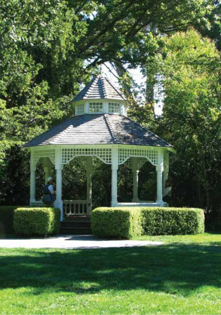
Relax and Unwind at Gazebo