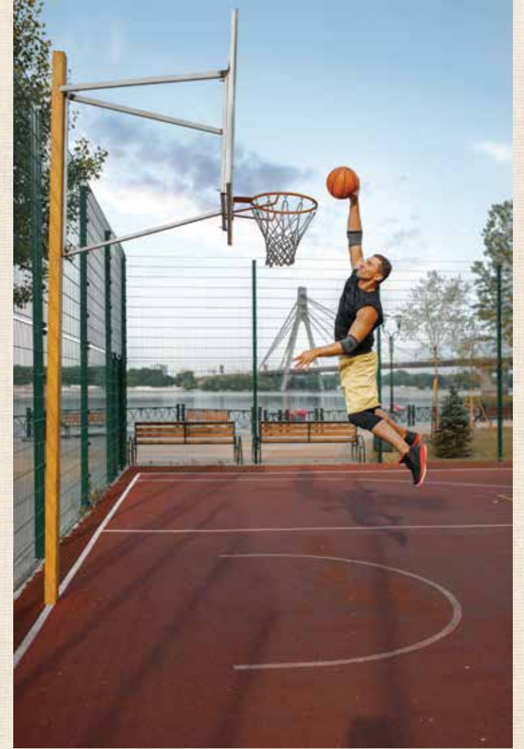
Basketball court & other outdoor sports facility