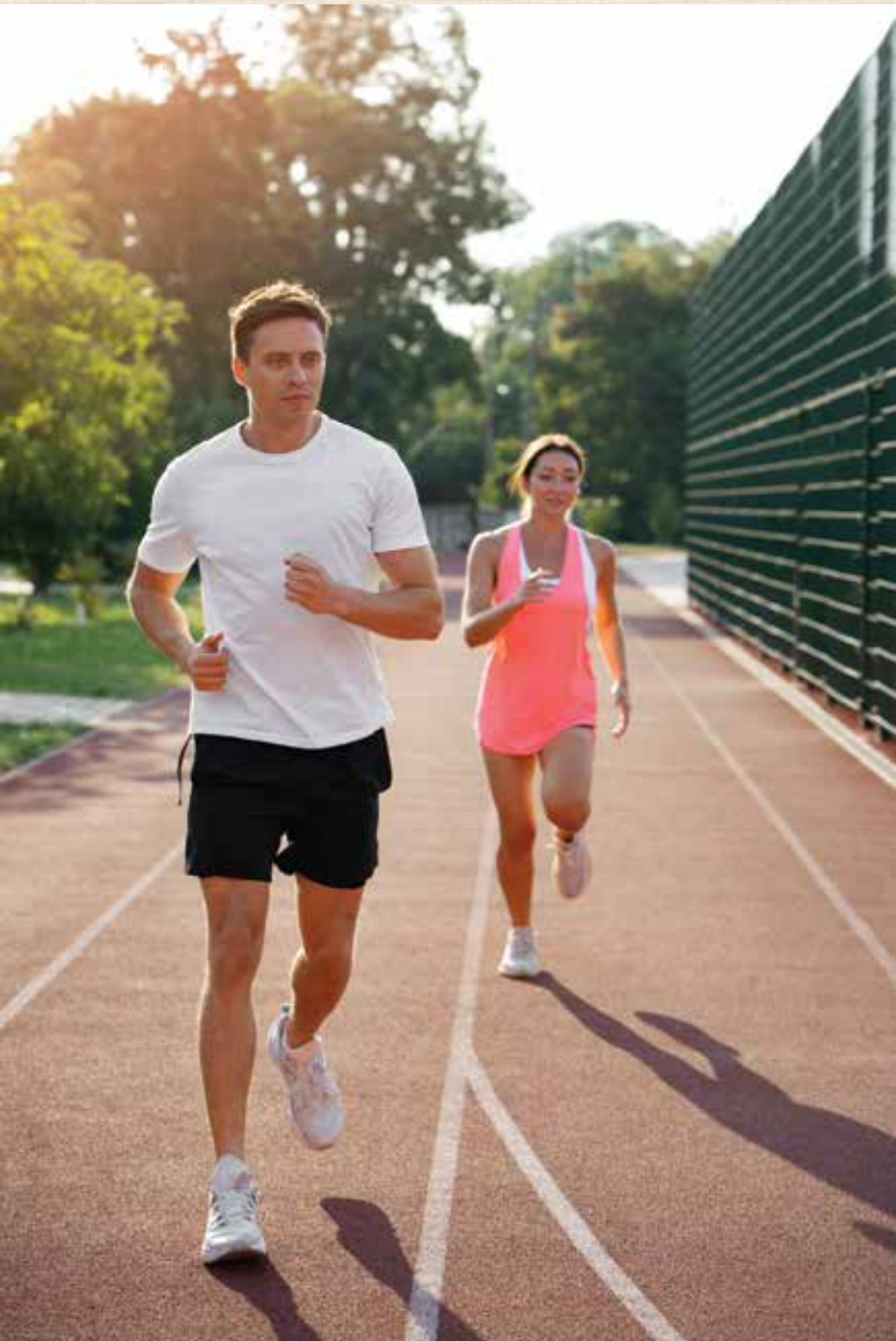
Jogging Track amidst Lush Greens