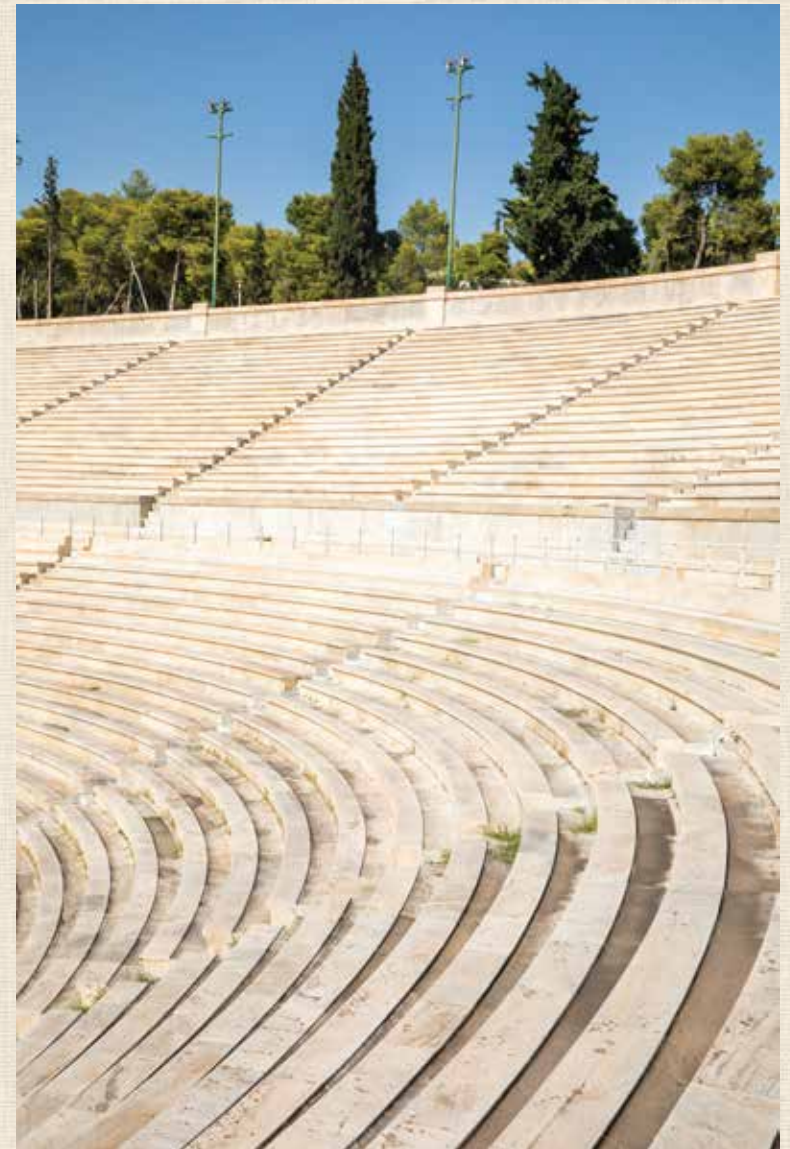
Open amphitheatre for entertainment

Excellence is the epitome of professionalism, expertise, and exceptional service in property transactions and management.