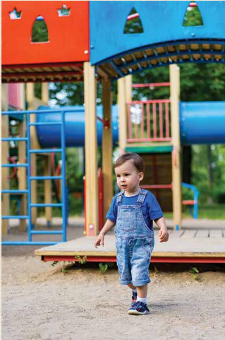
Kids play area for your little ones