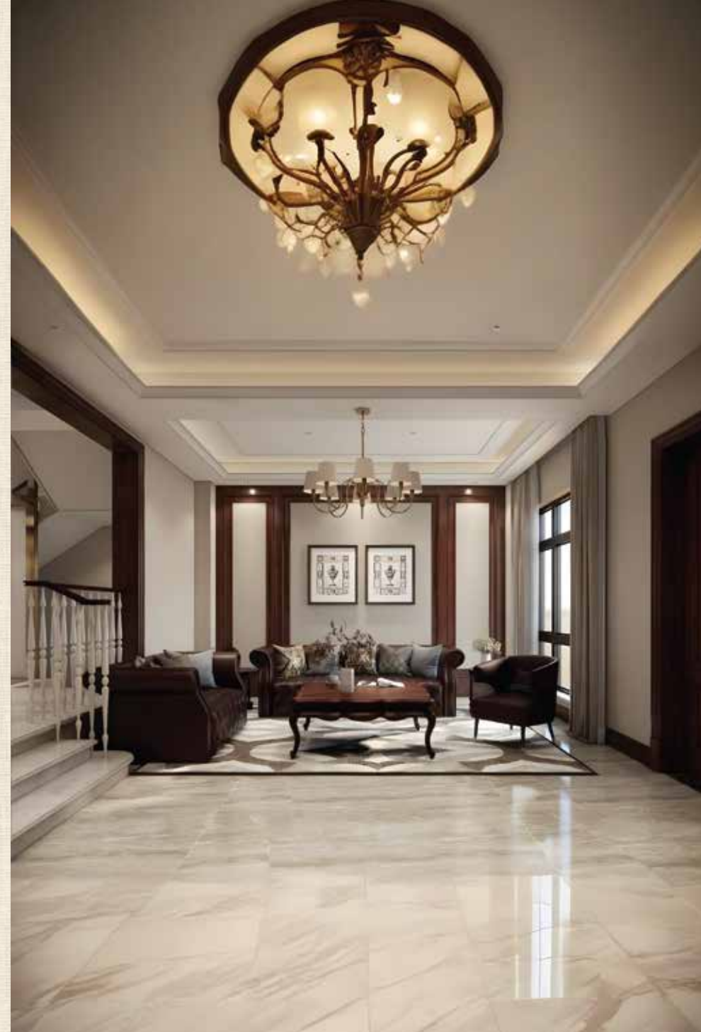
Ultra Luxury Waiting Lounge