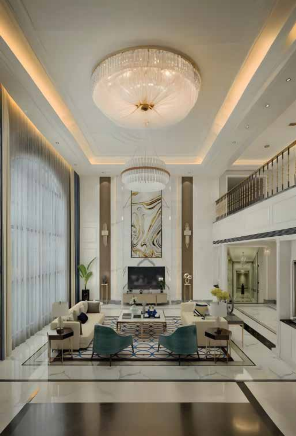
Double Height Entrance Lobby